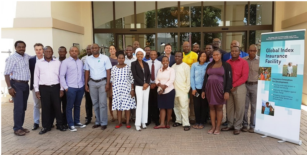
Participants and GIFF staff at the “Agriculture Insurance Training in Johannesburg, October 17-28, 2016

As part of its primary strategies, GIFF will continue to provide a platform upon which stakeholders can learn from one other and ultimately collaborate on building sustainable solutions for the development of index insurance. GIFF will also continue to promote innovative approaches, such as index insurance, to help vulnerable populations build their resilience amid the threat of climate disruptions.