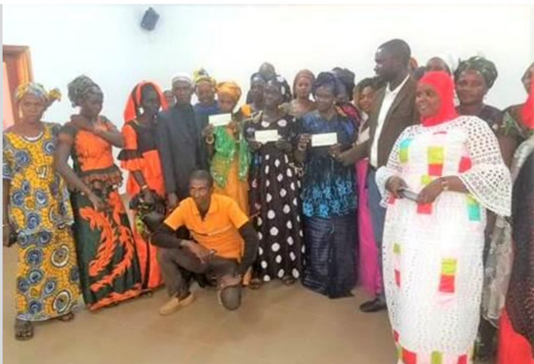
Farmers in Senegal receiving their compensations

In 2019, Senegal received a significant payout of US$ 22 m (XOF 13 bn) from African Risk Capacity (ARC) to cover losses due to crop failures resulting from the severe rainfall deficits and drought during the 2019 agricultural season. Read more