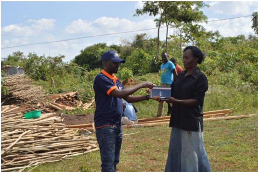
Local farmer receiving her payout from ACRE Africa in 2019.

As a long-standing GIIF implementing partner, ACRE has become a pioneer in providing climate risk solutions to rural Africa, facilitating more than 1.7 million contracts and protecting 8.5 million beneficiaries. Read more VIDEO