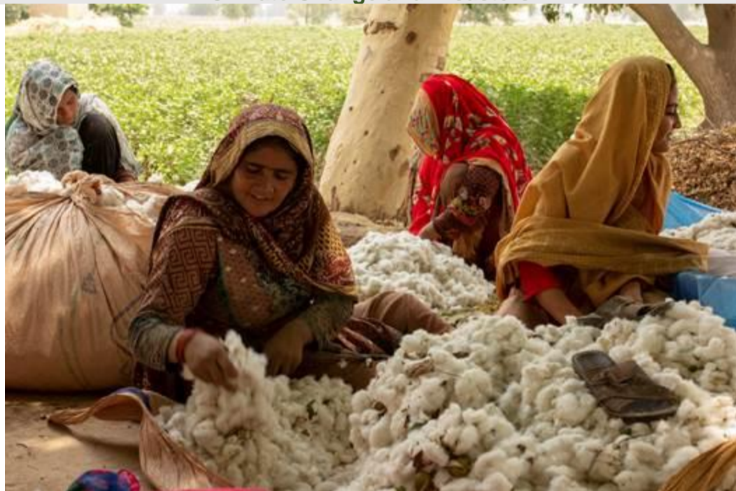
Farmers in Punjab collecting cottons

As part of “Strengthening Markets for Agriculture and Rural Transformation in Punjab” (SMART Punjab) project, GIIF has been providing insurance solutions to improve farmers’ resilience to climate change and natural disasters. Read more