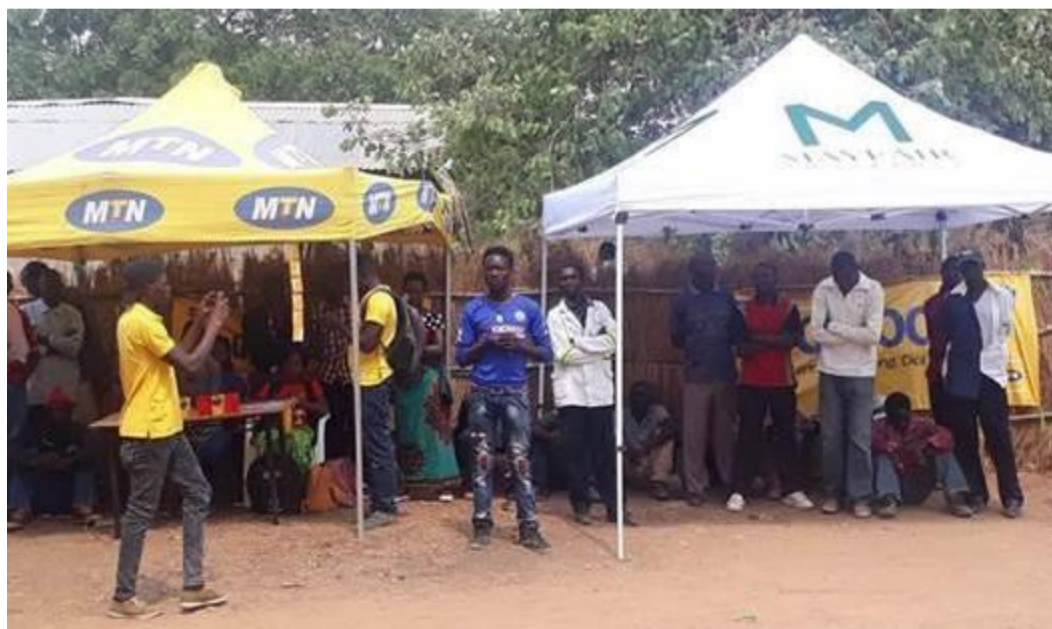
Farmer waiting for pay out on the World food program

Since 2016, GIIF has been providing technical assistance to Mayfair Insurance, a private insurer registered in Zambia, to build its capacity to underwrite insurance products that protect vulnerable farmers against weather-related crop losses. This partnership has resulted in the issuance of more than 2 million contracts, reaching approx. 10 million beneficiaries over the past two years. Read more VIDEO