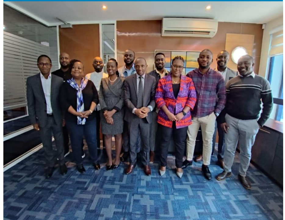
Photo: A study tour and knowledge session: a delegation of Nigerian industry experts on a knowledge exchange mission in Kenya

Looking East: Lessons for Nigerian Insurers from Kenya's Digital Insurance Ecosystem