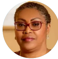
HE Judith Tuluka Sumwina Minister of State, Minister of Planning DRC