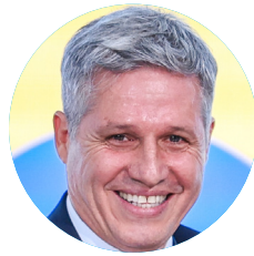
HE Paulo Teixeira Minister of Agricultural Brazil