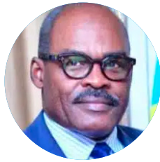
HE Nicolas Kazadi Minister of Finance DRC